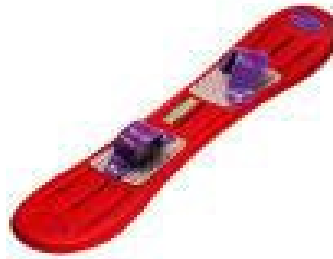
Plastic Snow Boards