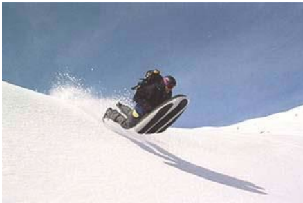
Air Boards / Inflatables