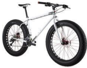
Fat Bikes (Winter)