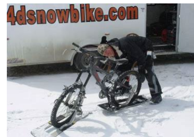
Conversion Snow Bikes